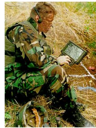
Joint context to service training