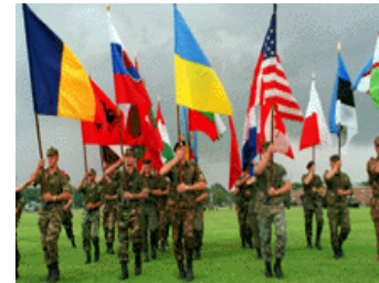
Incorporation of partners