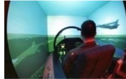
Distributed live, virtual constructive (LVC) capability