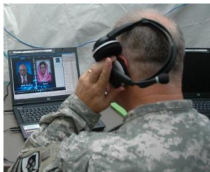
Joint online culture and language training