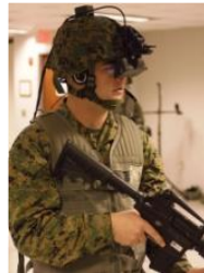
Joint enabled immersive training